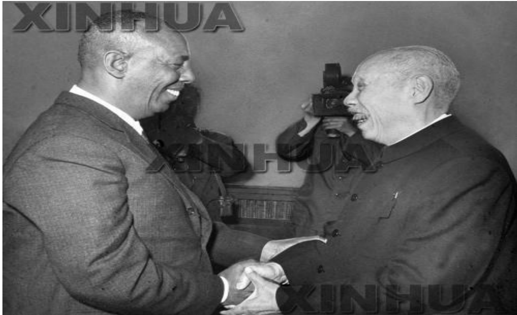
Beijing 14/5/1972 maxamed siyad iyo wasirka arimaha dibada china jipengfei