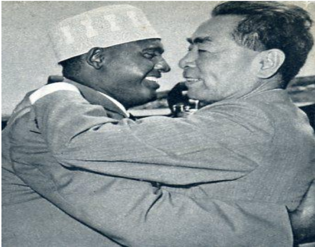
Muqdisho 4/2/1964R.W abdirashid ali sharmake iyo R/W:SHINAHA:zhou en lai

AUN maxamed siyaad barre 14/5/ 1972. Shiinuhu Soomaaliya wuxuu udhisay Garoonka kubada cagta ee muqdisho , wadada laamiga ah iyo isbitaal. dawladihii kumeelgaarka ahaa waxaa shinaha yimi AUN Cabdulaahi yuusuf axmed. waxay shina ubaahantahay afrika, Afrika albaabkeeda ayada soo xigana waa soomaaliya laakiin albaabku muda dheerbuu xirnaa wuuna mirirsaday waxaa loobahanyahay in ladayactiro dowladuna xiriir wanaagsan ee lajaan qaadikara wacyiga ay latimaado shinaha iyo dunida danuhu nooga kalaxiranyhihiinba ay meelkasta geyso ciddii kuhaboon aana lagu geyn reer hebel maqanacsanee safiir dalkaasa halasiyo ee halagu diro ninkii dal loodirayo muxuu dalkaas nooga soo qabankaraa, aqoon intee le'eg ayuuse uleeyahay dalkaas. macaa hadaan dawladnimadena Qoondadii qabiilku wali kagudbin reerkaas dhexdiisa halaga raadsho nin howsha qaban kara. Majecleyn inaan hadal siyasadeed kusoo khatimo mana ihi siyaasi arday maskiinaan ahay lakiin waxaan jeclahay dalkeyga rajadayduna waa inaan arko asagoo hormaray. insha allah waan arkin.