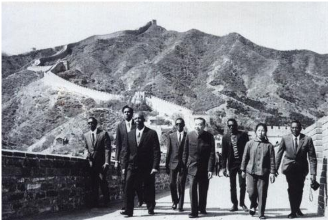
Great wall 15/1972 maxamed siyaad iyo jipengfei