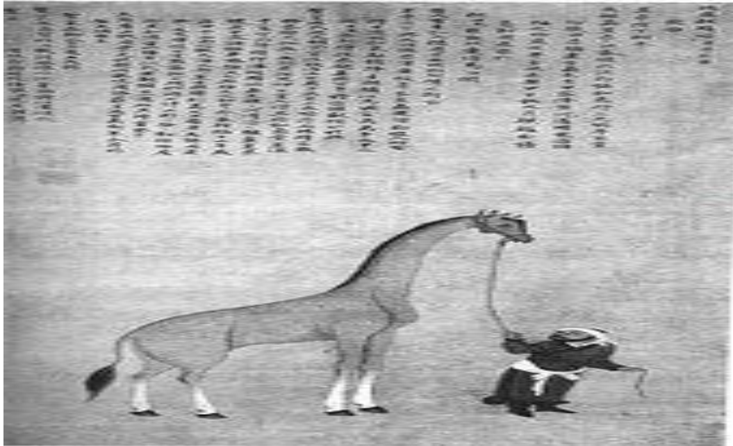
1422 Gari somaliya uu kala yimi zheng he

siday taariikhdu wariso waxaa labada umadood kadhaxeeyay xiriir qota dheer kaas oo intiisa badan ahaa dhanka ganacsiga waxaan kaxusi karnaa in 1421-1422 uu dhulkena yimid dhulmareenkii islaamka ahaa ee udhashay gobolka yunnan ee shiinaha magaca :zheng he(郑和) magaca islamka: Haji mohamed shamsudiin. Wadaadkaasi wuxu tagay muqdisho wuxuu soo xiray xiriir wanaagsan wuxuu kasoo noqday soomaaliya asagoo wata hadiyad uu kamidyahay Gari. Garigaas oo kusawiran melkasta oo tariikhda shiinaha lagu uruuriyo ama ay yaalaan sawirada dadkii hore.